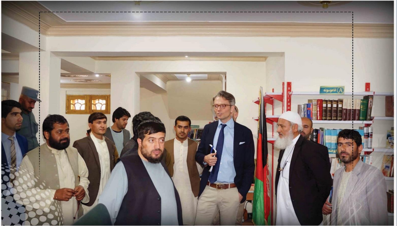
Swedish Ambassador is visiting our Library:

We believe in our Quality and we are ready to prove it for anyone.