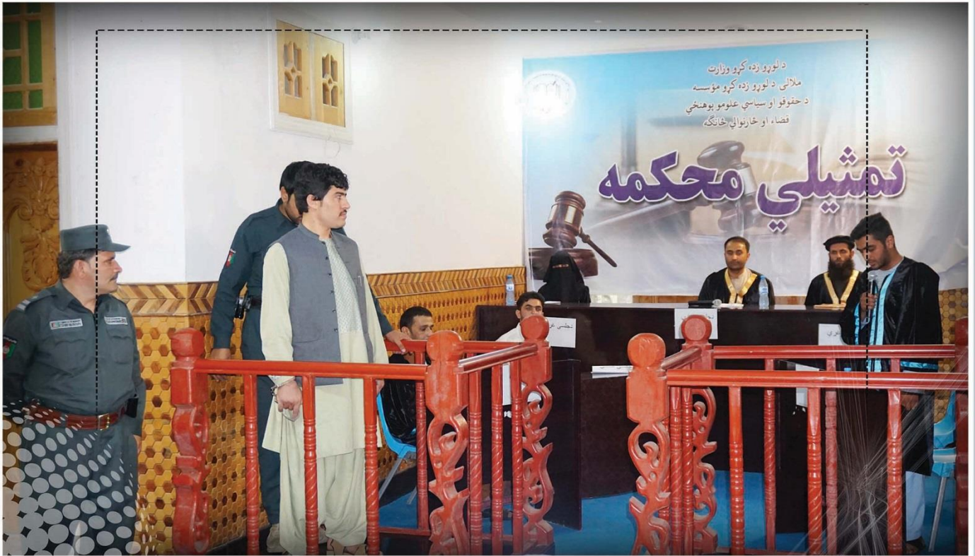
Law & Political Science Faculty Practical Work:

For practical work; Allegorical Court took place in every semester.