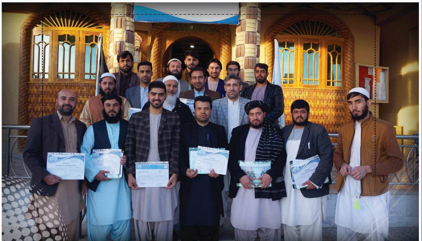
APR 3 days workshop:

For practical work; Allegorical Court took place in every semester.