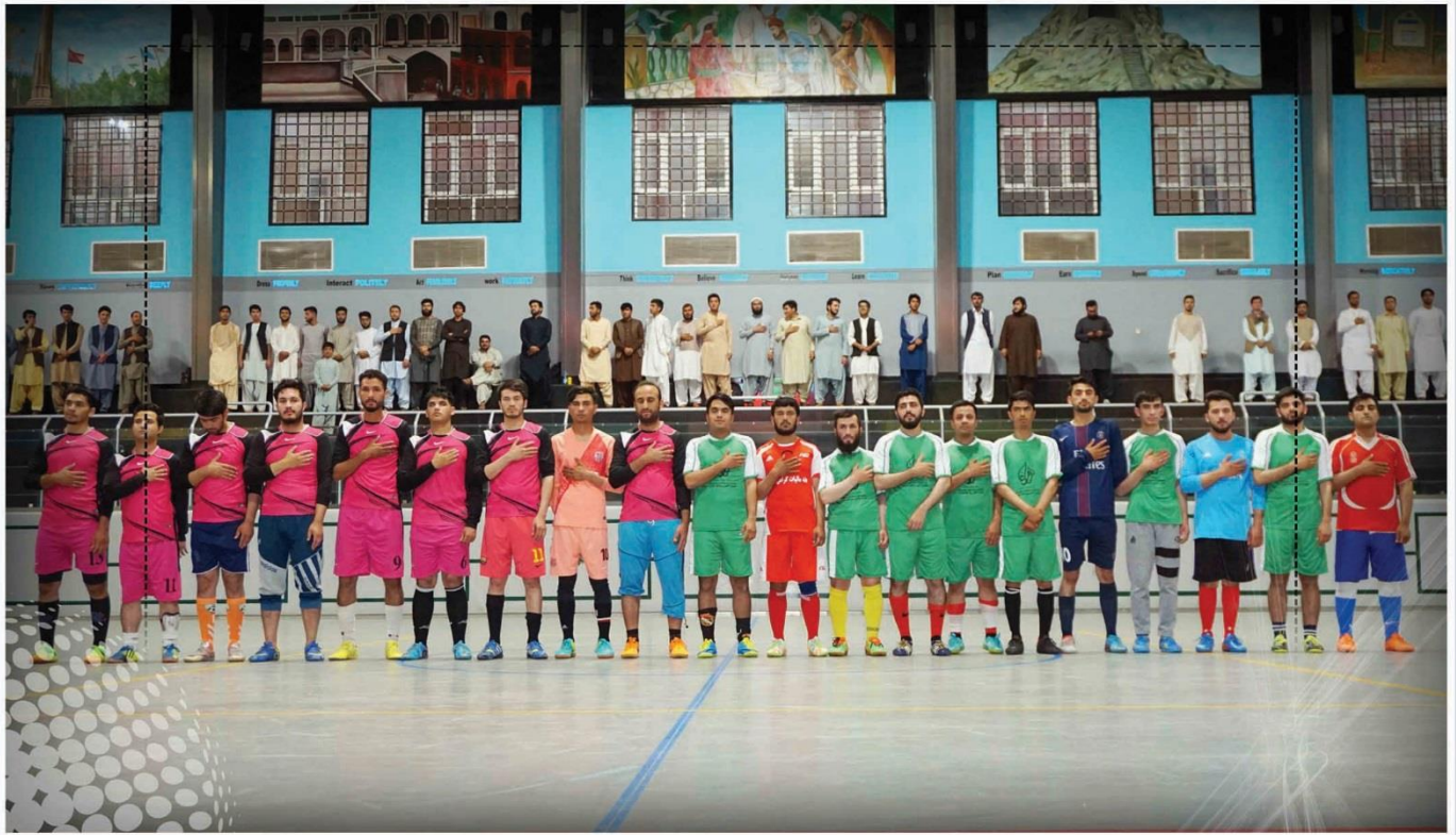
Medical Faculty Futsal Match

Providing sport environment for students is our main goal.