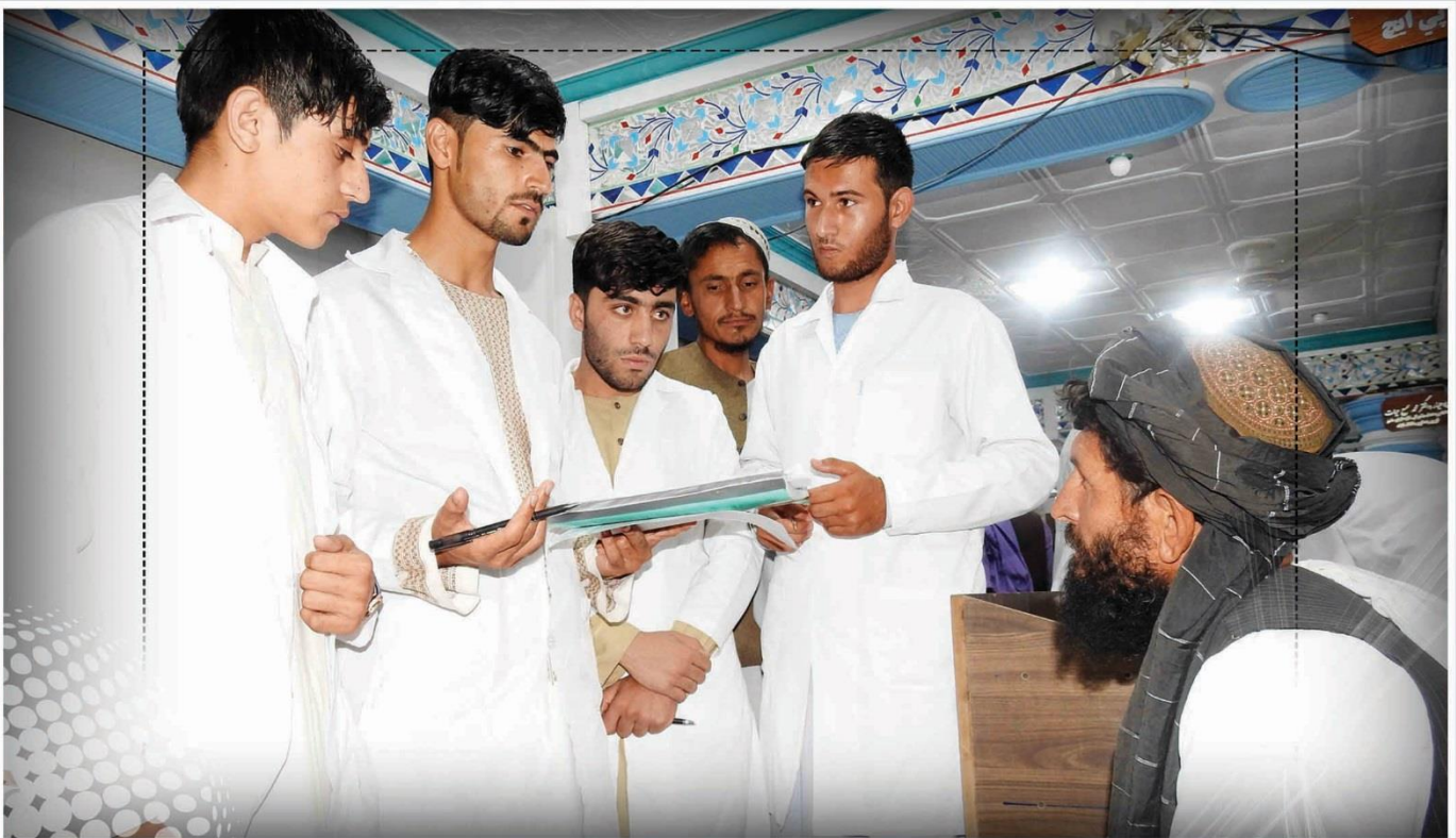
Medical Faculty Students in Saidal Hospital:

Providing sport environment for students is our main goal.